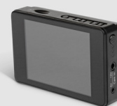
PV-500 ECO2 DVR