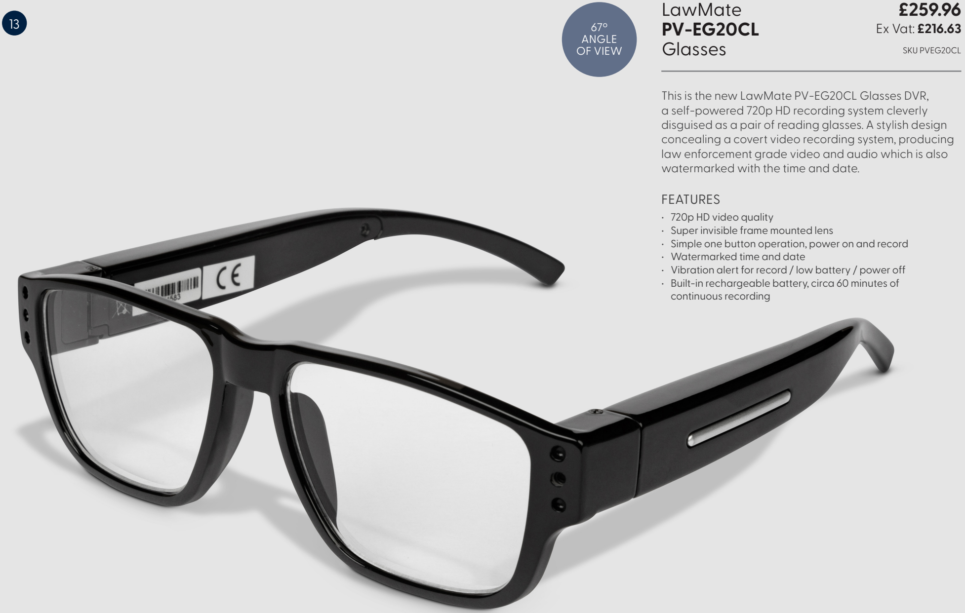
LawMate PV-EG20CL Glasses £259.96 Ex Vat: £216.63 SKU PVEG20CL

This is the new LawMate PV-EG20CL Glasses DVR, a self-powered 720p HD recording system cleverly disguised as a pair of reading glasses. A stylish design concealing a covert video recording system, producing law enforcement grade video and audio which is also watermarked with the time and date.