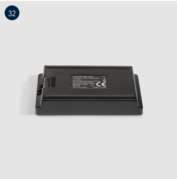
LawMate PV-500 4400mAh Extended Battery £59.95 Ex Vat: £49.96 SKU 669

This extended battery pack has double the capacity of the standard battery. Compatible with all LawMate PV-500 digital video recorders. Attach this 4400mAh battery to the back of your DVR and double the record time from 6 - 8 hours.