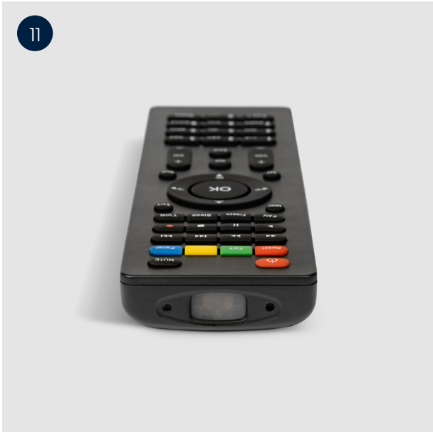
LawMate PV-RC10FHD Remote Control £249.95 Ex Vat: £208.29 SKU PVRC10FHD

Made in appearance to look perfectly 'at home' on your desk or coffee table. Hidden in the remote control is a high quality 3MP pin-hole camera, made especially for recording use. Combined with a high quality AGC microphone and watermarked time/day/date stamping, you can create law enforcement grade video and audio recordings.