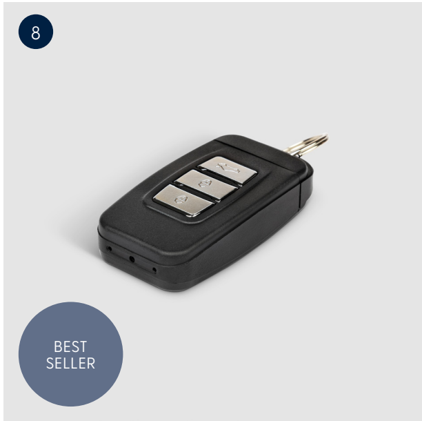
LawMate PV-RC200HD2 Key-Fob £184.96 Ex Vat: £154.13 SKU 552

The LawMate RC200HD2 key fob is a 1080p high-definition camera offering a 5 mega-pixel sensor capable of recording video or taking still images. With a fast start-up time, this camera can be recording video or taking still images in seconds.