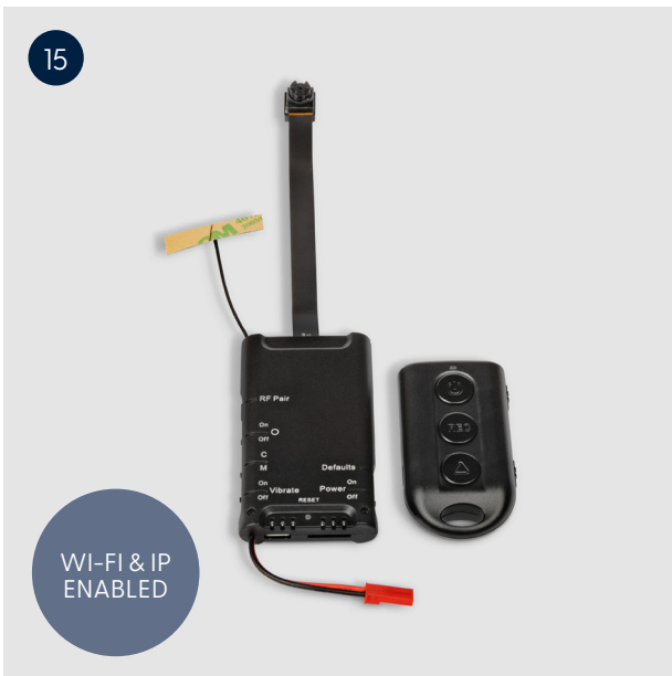
LawMate PV-DY20i Covert Camera System