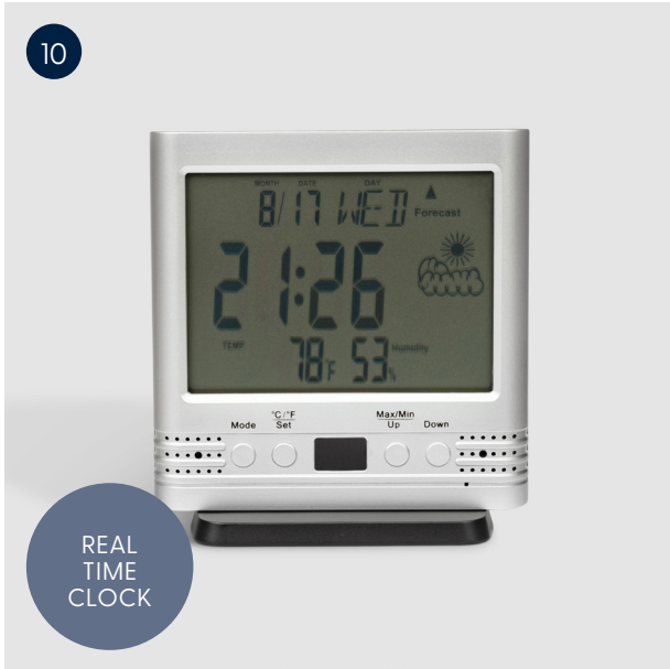
LawMate PV-TM10FHD Thermometer & Clock £216.63 Ex Vat: £259.95 SKU PVTM10FHD

The ultra-slim and modern-looking desktop thermometer and clock can be either desk mounted using the supplied stand, or wall mounted using the supplied mount. Using an ultra-small 1/3 inch progressive sensor, the LawMate PV-TM10FHD will capture incredibly crisp and clear 1080p HD video. In Photo Mode, there is a new upgraded 5mp sensor.