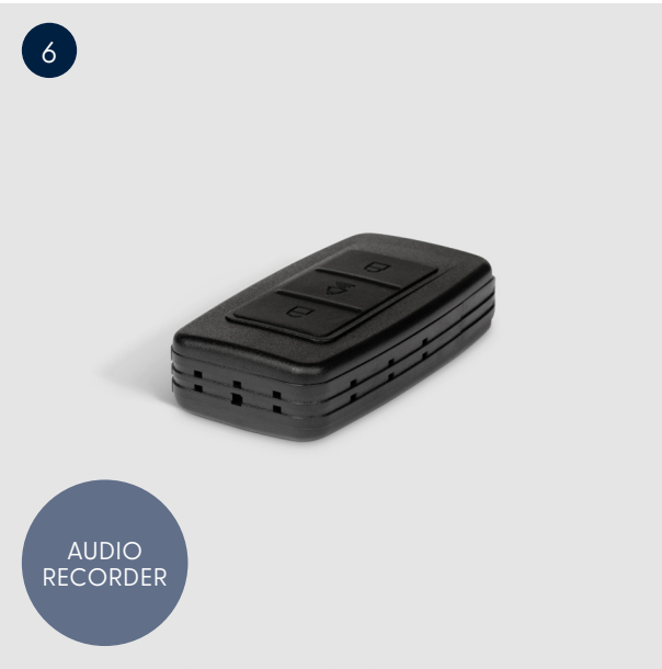
LawMate PV-AR100 Key-Fob £84.95 Ex Vat: £70.79 SKU 668

Disguised as a standard car key-fob., the LawMate PV-AR100 audio recorder is a device with just a one-button recording and a one-button stop.