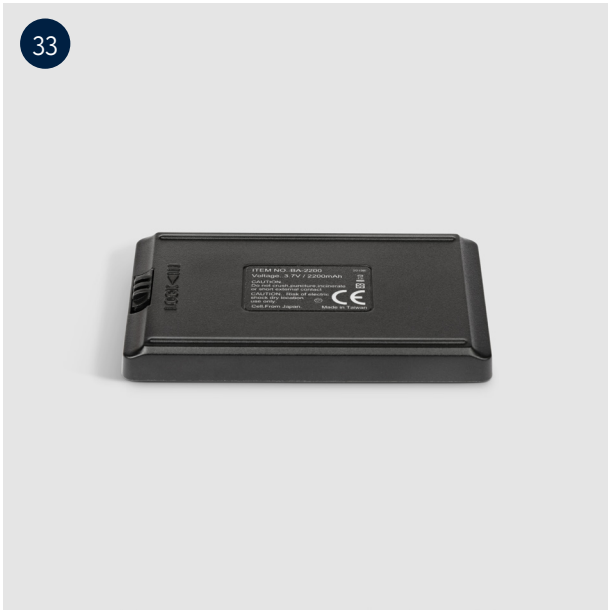
LawMate PV-500 Li-On Battery £39.95 Ex Vat: £33.29 SKU 651

This extended battery pack has double the capacity of the standard battery. Compatible with all LawMate PV-500 digital video recorders. Attach this 4400mAh battery to the back of your DVR and double the record time from 6 - 8 hours.