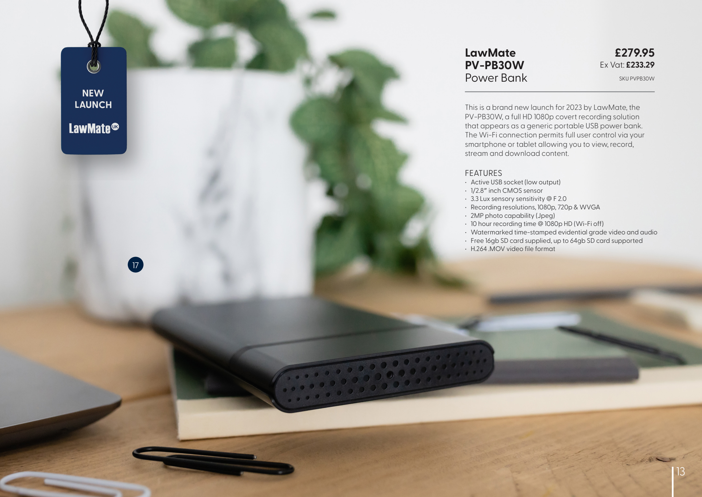
LawMate PV-PB30W Power Bank