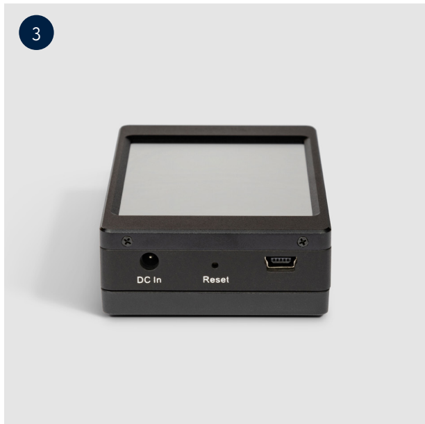
LawMate PV-500 Neo Pro DVR £349.96 Ex Vat: £291.63 SKU PV500NP

The Wi-Fi connection of the PV-500 Neo Pro recorder allows the unit to connect to Android and iOS phones and tablets, to provide remote full system control and live monitoring. The recorder is also fitted with a 3 inch touch-screen allowing the user to either control the unit manually, or via the LawMate Wi-Fi app.