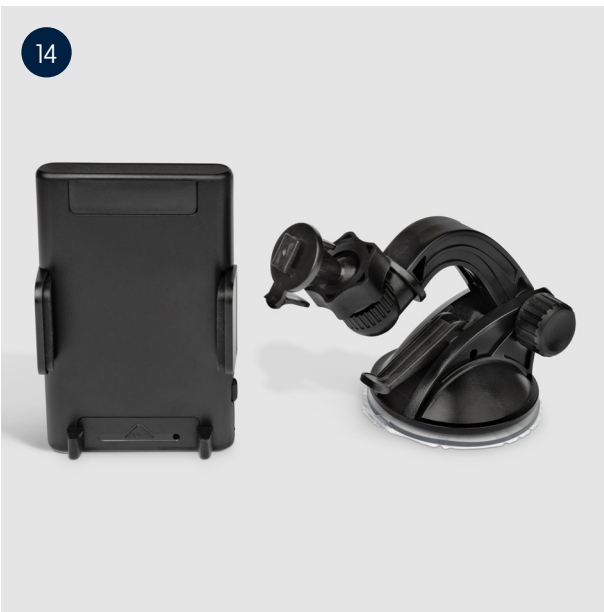
LawMate PV-PH10W Car DVR