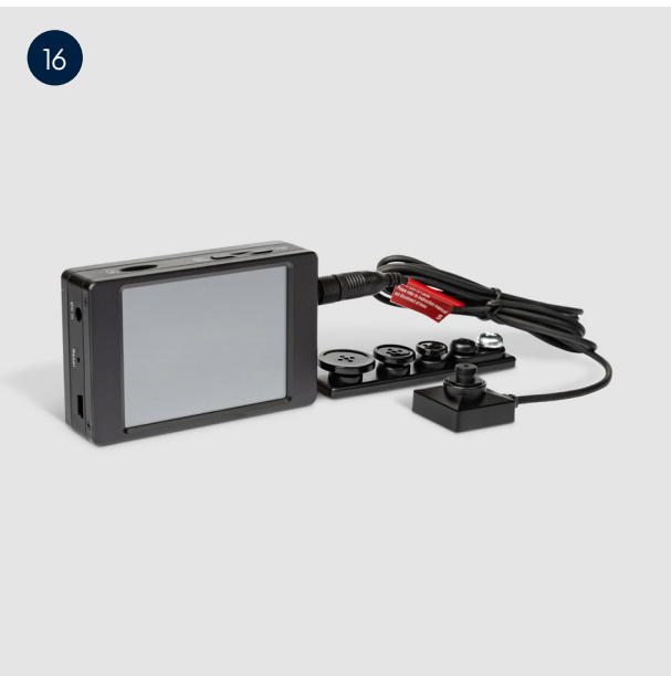
LawMate PV-500 Neo Pro & BU18HD Neo Camera Package