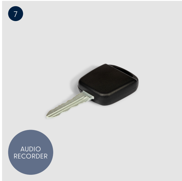
LawMate PV-AR300 Car Key £134.95 Ex Vat: £112.46 SKU PVAR300

The LawMate PV-AR300 audio recorder, cleverly disguised as a standard car key, has a simple one-button record function making its operation straight forward and simple. The fob and the key element are detachable, so the fob alone can be hidden and used independently.