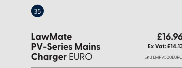
LawMate PV-Series Mains Charger EURO £16.96 Ex Vat: £14.13 SKU LMPV500EURO

Genuine LawMate Euro 2-pin 5 volt adaptor, suitable for all LawMate PV-series recorders and DVR's.