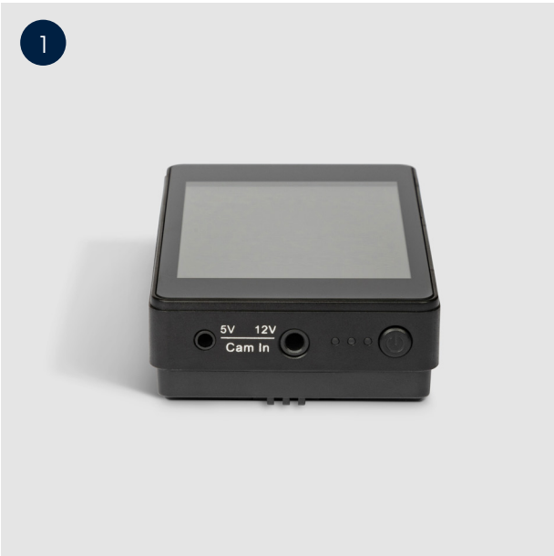
LawMate PV-500 ECO2 DVR £299.95 Ex Vat: £249.96 SKU PV500ECO2

The LawMate PV-500 ECO2 is a first-level law enforcement grade pocket digital video recorder. The recorder has the ability to record continuously or can be set to motion activation. Suitable for use in body-worn covert video applications, or stationary covert video operations.