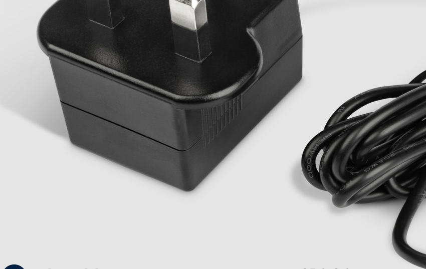
LawMate PV-Series Mains Charger UK £16.96 Ex Vat: £14.13 SKU 1mcharg

Genuine LawMate UK 3-pin 5 volt adaptor, suitable for all LawMate PV-series recorders and DVR's.