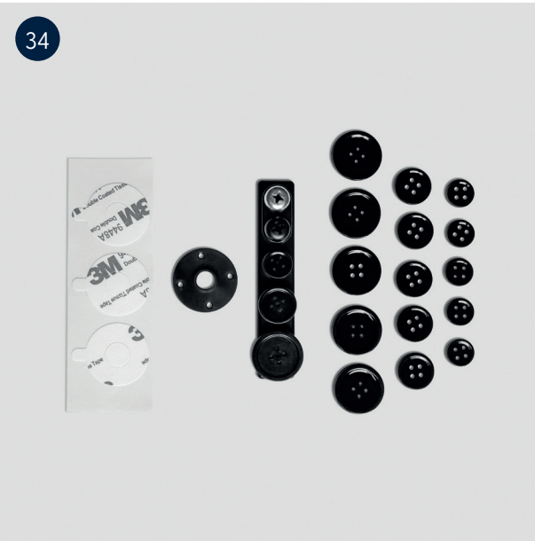
LawMate Button Camera Spare Accessory Pack £14.94 Ex Vat: £12.45 SKU LMBUACC

This is a spare battery for all LawMate PV-500 digital video recording systems. Rated at 2200mAh it will provide 3 - 4 hours of recording time.