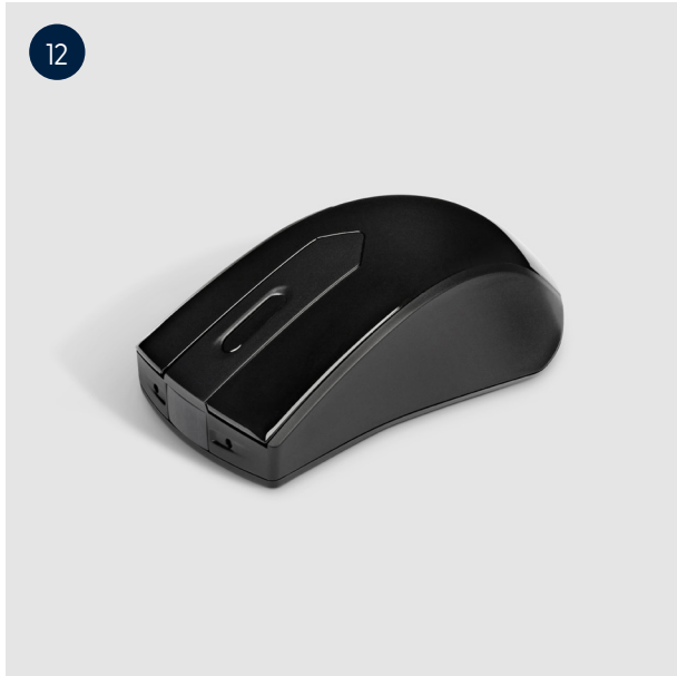
LawMate MU10 Wireless Mouse £244.96 Ex Vat: £204.13 SKU Immu10

A unique video recorder cleverly disguised as an everyday wireless mouse. Once activated, the wireless mouse will power itself via a rechargeable battery for up to 9 days. If used with the supplied cable, it can power from USB indefinitely and looks like any other normal wired mouse. Captures crisp, clear 720p HD video and excellent audio.