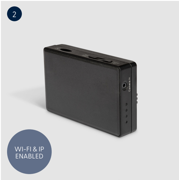
LawMate PV-500 L4i DVR £339.95 Ex Vat: £283.29 SKU PV500L4i

Part of the range of Wi-Fi and IP enabled devices from LawMate, the Wi-Fi connection allows the recorder to connect to Android and iOS phones and tablets to provide remote full system control and live monitoring.