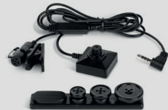
CM-BU20 CMOS CAMERA LENS