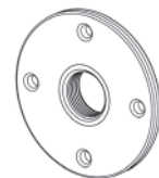
DIY LENS COVER BUTTON